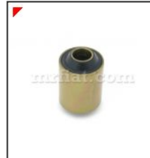
Dino 2000 Metal Lower Swing...