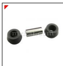
Dino 2000 Rear Lower Shock...