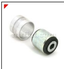
Dino 2000 Rear Axle Front...