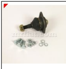
Dino 2000 2400 Lower Ball...