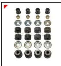
Dino 2000 Rear Axle Shock...