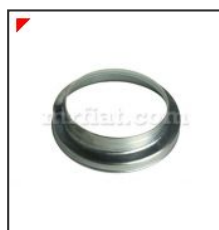
Dino 2000 Front Axle Seat...