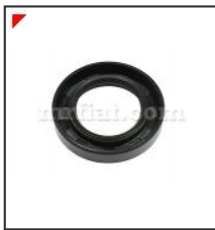
Dino 2000 Rear Axle Oil Seal