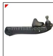
Dino 2000 2400 Front Axle...