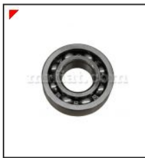
Dino 2000 Rear Axle Wheel...