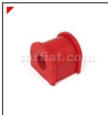
Dino 2000 2400 Spider Front...