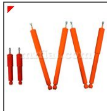
Dino 2000 Shock Absorber Set