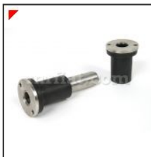
Dino 2000 Rear Axle Silent...