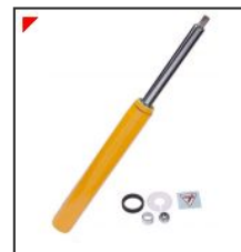
Dino 2400 Spider Koni Rear...