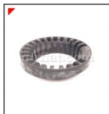
Dino 2400 Rear Rubber Ring