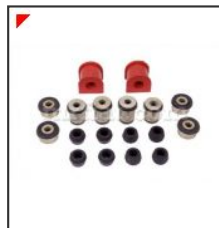
Dino 2400 Spider Front...