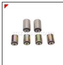
Dino 2400 Rear Axle Repair Set