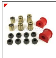
Dino 2400 Coupe Front...