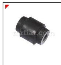
Dino 2000 2400 Front Lower...