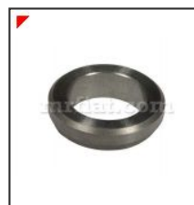
Dino 2000 Coupe Spider Drive...