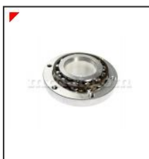
Dino 2000 Wheel Bearing Set