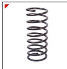
Dino 2400 Front Shock Absorber...