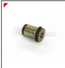
Dino 2000 2400 Metal Upper A...