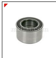
Dino 2400 Rear Wheel Bearing