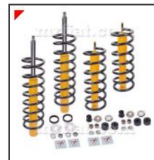
Dino 2400 Coupe Complete Shock...