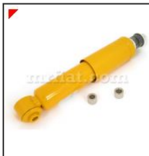
Dino 2000 2400 Koni Front...