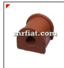
Dino 2400 Coupe Front Axle...