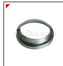
Dino 2400 Front Axle Spring...