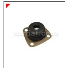
Dino 2000 2400 Lower Ball...