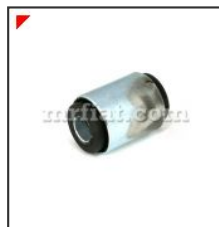
Dino 2400 Rear Axle Suspension...