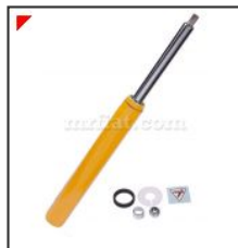
Dino 2400 Coupe Koni Rear...