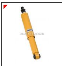
Dino 2000 Rear Shock Absorber