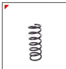
Dino 2400 Rear Road Spring