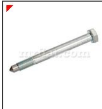
Dino 2000 2400 High Tensile...