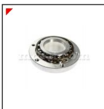
Dino 2000 2400 Wheel Bearing...