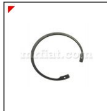
Dino 2400 Rear Wheel Bearing...