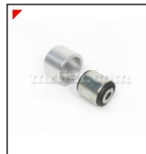
Dino 2000 Rear Axle Rear...