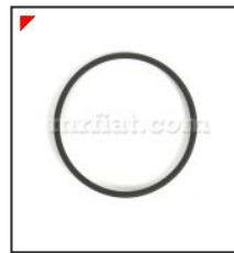
Dino 2000 Rear Axle Wheel...