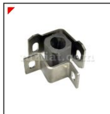
Dino 2400 Rear Axle Torsion...