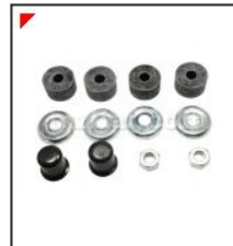
Dino 2000 2400 Front Axle...