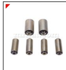
Dino 2000 Rear Axle Suspension...