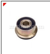
Dino 2000 2400 Metal Lower...