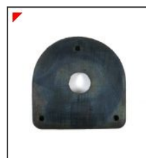
Dino Spider 2000 2400 Steering... 12180-319

Steering column rubber2000for Fiat Dino Spider 2000-2400 models from 1966-72. There is a...