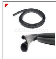
Dino Spider 2000 2400 Rear... 12180-350

Rear hardtop baseline gasket for Fiat Dino Spider 2000-2400 models from 1966-72. There is...