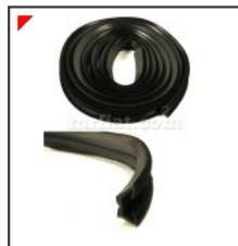
Dino Spider 2000 2400 Window... 12180-926

Window channel set for Fiat Dino Spider 2000-2400 models from 1966-72. There is a 2-3 week...