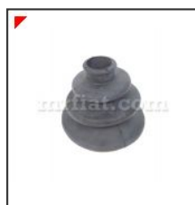
Dino Spider 2000 2400 Cowling... 12180-306

Cowling gear lever2400for Fiat Dino Spider 2000-2400 models from 1966-72. There is a 2-3...