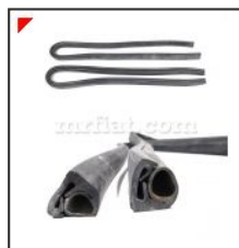
Dino Spider 2000 2400 Side... 12180-360

Side hard top gasket set for Fiat Dino Spider 2000-2400 models from 1966-72. There is a...