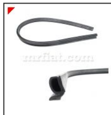
Dino Spider 2000 2400 Front... 12180-340

Front window hard top gasket for Fiat Dino Spider 2000-2400 models from 1966-72. There is...