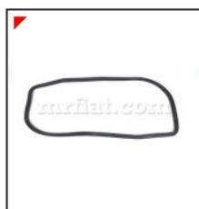
Dino Spider 2000 2400 Rear... 12180-310

Rear window hard top gasket for Fiat Dino Spider 2000-2400 models from 1966-72. There is a...