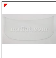
Dino Spider Windshield GS-DINO-004

Windshield for Fiat Dino Spider models. Center height is 51.8 cm.