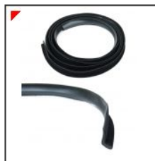
Dino Spider 2000 2400 External... 12180-840

External window scrapper set for Fiat Dino Spider 2000-2400 models from 1966-72. There is...