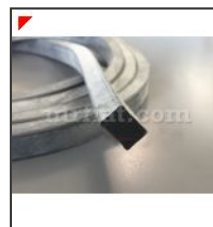
Dino Spider 2000 2400 1966-72... 12180-400

Battery cover gasket for Fiat Dino Spider 2000 and 2400 models from 1966-72. There is a...