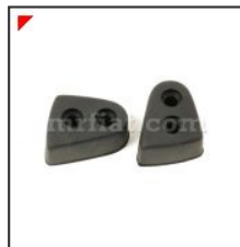
Dino Spider 2000 2400 Door... 12180-335

Door striker set for Fiat Dino Spider 2000-2400 models from 1966-72. There is a 2-3 week...