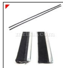
Dino Spider 2000 2400 Inner... 12180-919

Inner glass scrapper set for Fiat Dino Spider 2000-2400 models from 1966-72. There is a...