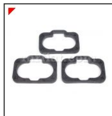
Dino 2400 Spider Foam Rubber... 12180-600

3 piece airbox rubber foam set for Fiat Dino 2400 Spider models from 1966-72. There is a...