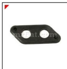
Dino Spider 2000 2400 Heating... 12180-373

Heating tube flange for Fiat Dino Spider 2000-2400 models from 1966-72. There is a 2-3...