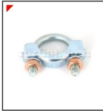
1100 R 1200 Cabrio Exhaust...