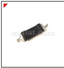
1100 124 1300 1500 Dino Long...