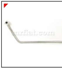
1100 D 1200 103 Cabrio Header...