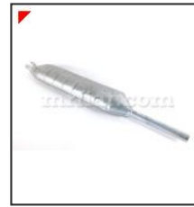
1100 D 1200 103 Cabrio Center...