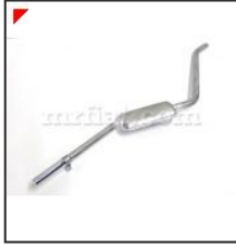
1100 D 1200 103 Cabrio Rear...