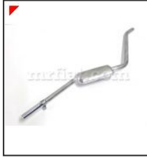
1100 D 1200 103 Cabrio Rear...