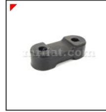
1100 1200 1500 Cabrio 118 H/K...