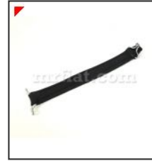
500 Bianchina Soft Top Strap RF-500-050