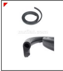
Bianchina Transformabile Soft Top... GS-A500-008

Soft top gasket for Bianchina Transformabile models.