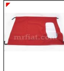
Bianchina Transformable Red Cloth... RF-A500-004

Clutch red roof fabric for Bianchina Transformable models. Part #: RF-A500-004