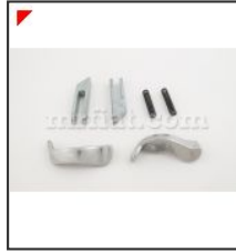
500 N Bianchina Transformable... RF-500-044