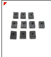
Bianchina Transformabile Roof... RF-A500-003

Set of 10 roof rubbers for Bianchina Transformabile models.