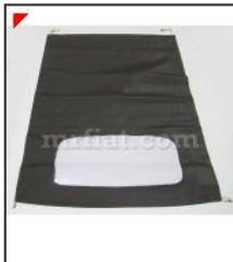
Bianchina Transformable Dark Grey... RF-A500-005

Dark grey roof fabric for Bianchina Transformable models. Made in Italy.