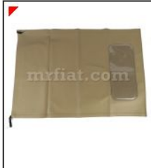
Bianchina Transformable Beige Roof... RF-A500-002

Beige roof fabric for Bianchina Transformable models. Part #: RF-A500-002