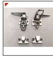
Autobianchi Bianchina Cabriolet... RF-A500-007

Set of roof lock clamps for Autobianchi Bianchina Cabriolet models. Part #: RF-A500-007